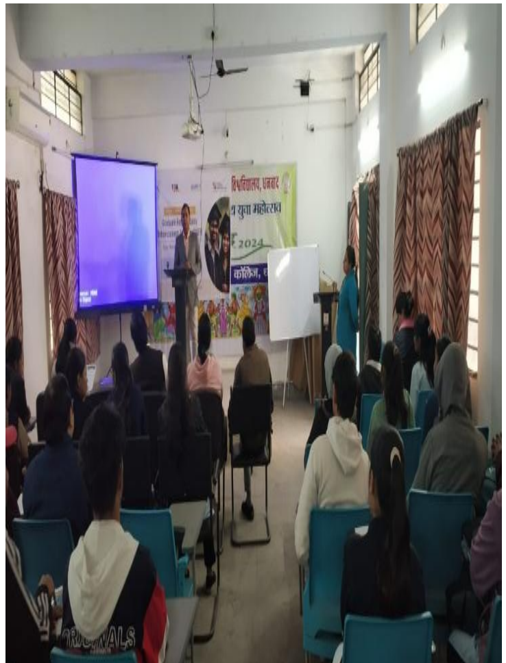
Vote of thanks is being conferred