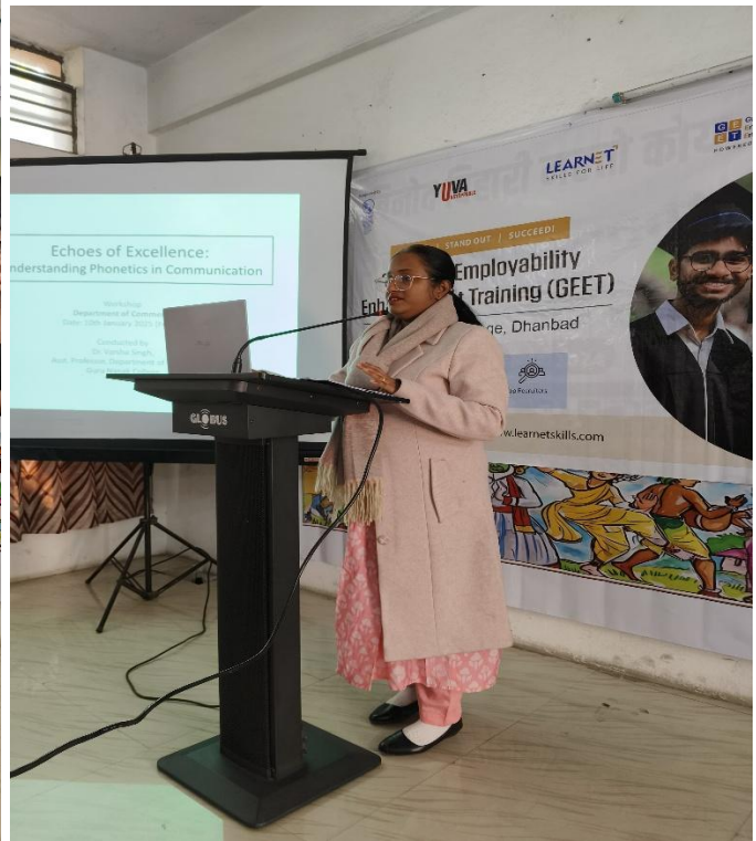
Video-audio media is used to demonstrate forms of communication