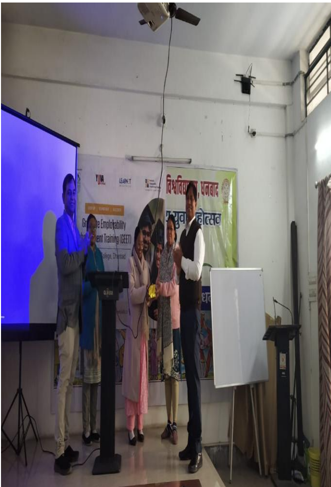
The Key Note Speaker is being facilitated